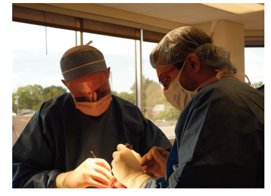
Another study that has just been expanded for further investigations is "The Risk of Medication Related Osteonecrosis of the Jaw in the Pediatric Population: A Retrospective Study."

mandibular field blocks, we hypothesize that less injections will be required to achieve patient comfort during an extraction procedure in the setting of an infection. Additionally, we aim to assess the overall anesthetic effectiveness, speed of onset, and overall patient pain.